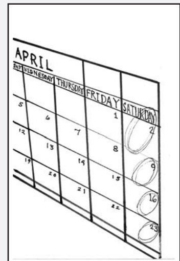
Every seven days, the Sabbath gives us hope for a better future.

How does our resting on the Sabbath day show our faith in the promise that Jesus saves us now? How does our rest also show our belief that Jesus will make the skies and earth new again in the future?