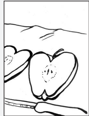
The trees and the food are a gift.

God gives you many wonderful gifts. How can you protect these gifts? How can you use these gifts for Him?