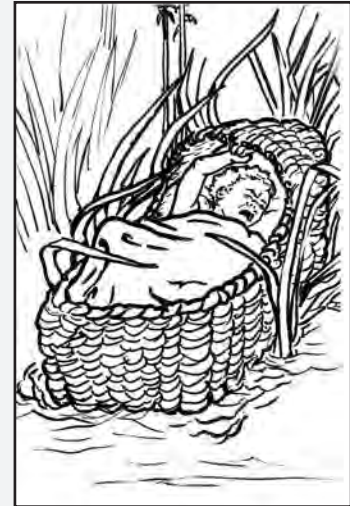
When Moses was born, his parents hid him from Pharaoh, king of Egypt.

What tests and troubles have you had because of your faith? What did you give up or lose because of your faith? How does the reward waiting for you cheer your heart?