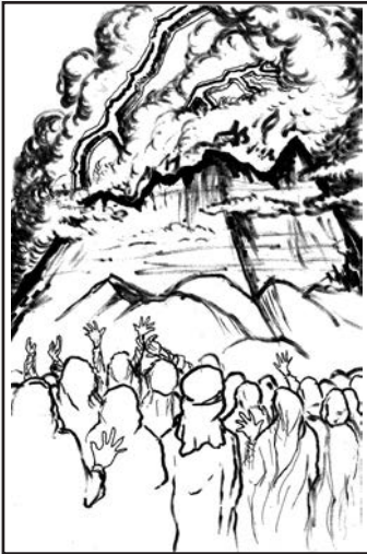
God talked with His people at Sinai.

In Deuteronomy 4, we read the powerful warnings God gives to His people. God warns His people not to break His agreement. If they do, they will lose the blessings He gave them as His special people. So, they must stay loyal to God. What will help the people stay loyal? Obedience to God and remembering the love He showed them in the past. Moses tells the people to remember that God saved them from Egypt by “ ‘his power and strength. You saw the troubles that tested [showed what was in the hearts of] the people. You saw miracles and wonders. You saw war and the terrible [surprising] things that happened’ ” (Deuteronomy 4:34, ERV). For sure, God did many wonderful things for His people. He also did these things in a powerful way to help His people never to forget everything He did for them.