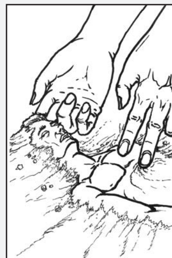
God bends down and starts to shape mud. He makes the mud into a man.

The Bible story about how life on earth started is very different from what most people today believe. What should this tell us about how much we need to depend upon the Bible to show us truth?