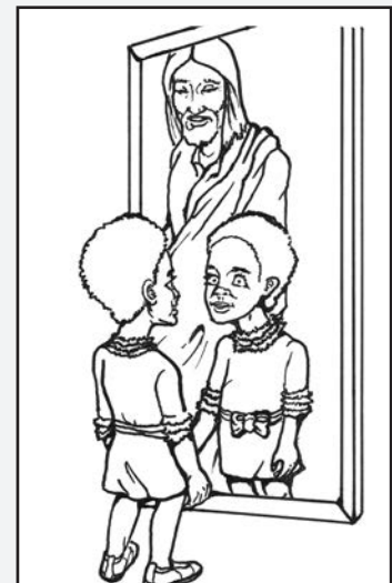
God looks at us and sees Jesus and His perfect life.

Read Romans 4:1–7. Look at what Paul says in Romans 4:1–7 about Genesis 15:6. Pray over these verses. Write in your own words what these verses say to you.