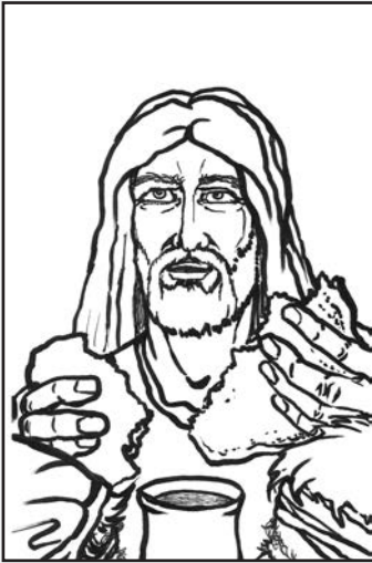
“Jesus eats the bread and the wine with His followers.”

ADDITIONAL THOUGHT: “Jesus eats the bread and the wine with His followers. By doing this, Jesus shows His followers that He agrees to be their Savior. Jesus also gives them the new agreement. Everyone who accepts Jesus will become a child of God. The children of God will share in everything that the Father will give Jesus. The new agreement makes these things possible. The new agreement also permits the followers of Jesus to have every blessing that heaven can offer in this life and in the life to come. The blood of Jesus makes this new agreement legal. As part of the new agreement, the followers of Jesus will eat the bread and drink the wine in the future. Then they will remember that Jesus died for each one of them. Jesus also died for all sinners everywhere on the earth.” —Ellen G. White, The Desire of Ages , page 659, adapted.