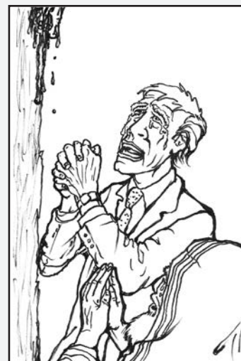
The blood of Jesus joins Jews and non-Jews and brings them near to God.

The blood of Jesus joins Jews and non-Jews and brings them near to God. Jesus works to make the new agreement possible for everyone who believes in Him.