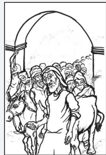
Cyrus served God by making the Jews free from Babylon.

The special message about Cyrus shows us that only God knows the future (Isaiah 41:4, 21–23, 26–28; Isaiah 44:26). God also invites Cyrus to know Him personally. God knows the name of Cyrus before he is born (Isaiah 45:3).