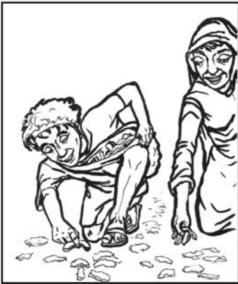
God gives the Israelites the miracle of manna.

When God asks Moses to lead the Israelites out of Egypt, it is clear that God's people need to learn who God is again. God wants the Israelites to worship Him. He promises them a wonderful future. The Sabbath is an important learning experience for God's people. The Sabbath helps them to discover what they have forgotten. The Sabbath also shows other countries around Israel that Israel has a special connection with God. The experience of the manna shows God's way of educating the Israelites.