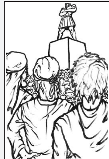
The three Hebrew boys follow the second commandment with all their hearts.

Read Revelation 14:6–12. What do these verses teach us about how important the question about worship will be in the end times right before Jesus comes back?