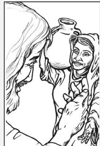
The story about Jesus and the woman at the well shows how Jesus heals a broken spirit.

What is the best way to teach someone to worship “in spirit and truth”? When may someone need more of one than the other?