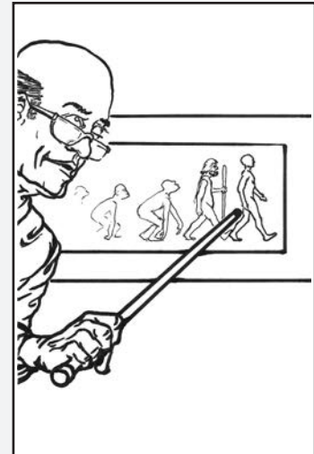
We can worship false ideas.

What are some of today’s popular beliefs and ideas that go against Bible truth? How can we as a church protect ourselves from teaching these ideas in our own schools?