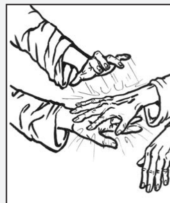
Jesus shows us the best picture of God.

Jesus showed us the Father. God asks us to “follow his example” and show who He is to people too (Ephesians 5:1, Nlrv). What does it mean to follow God’s example? What can we learn from Jesus about how to do this?