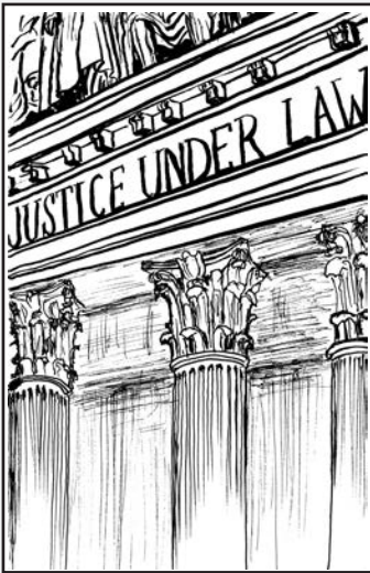
The idea of government was put in place by God Himself.

“We must accept that God put government in place. We must teach other Christians that we have a duty from God to obey the laws of the government. But what would happen if the laws of the government were at war with God’s laws? Then we must obey God instead of man. God’s word in the Bible must be shown respect above any laws of the land.”—Ellen G. White, The Acts of the Apostles [Leaders] , page 69, adapted.