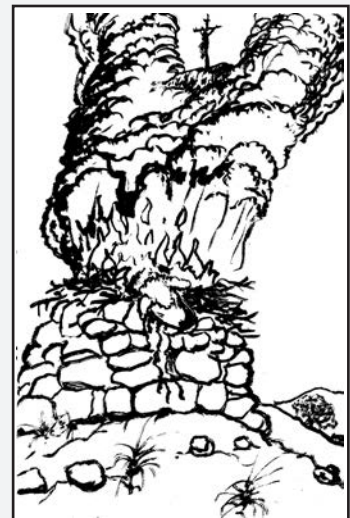
All the symbols of the old law pointed to Jesus.

① “In Romans 7:25, Paul gives us his clearest teaching about the law of sin. From this verse, we learn that the believing person serves the Law of God at the same time that he serves the Law of sin. The sinner is made right with God and, at the same time, he stays a sinner. Paul does not say, ‘My mind serves the Law of God.’ And Paul does not say, ‘My flesh serves the Law of sin.’ Instead, Paul says, ‘I myself.’ By this wording, Paul shows that the whole person is a slave in two ways. . . . What Paul means to say is: Believers are sinners at the same time they are right with God. They are right with God because they believe in Jesus. Jesus’ holy life covers them. But they are sinners, because they cannot pay the penalty for having broken the law. They continue to want to do evil. They are the same as sick people who need a doctor.”—Martin Luther, Commentary on Romans , pages 114, 115, adapted. Can we agree with what Luther wrote here? Yes or no? Give reasons for your answers.